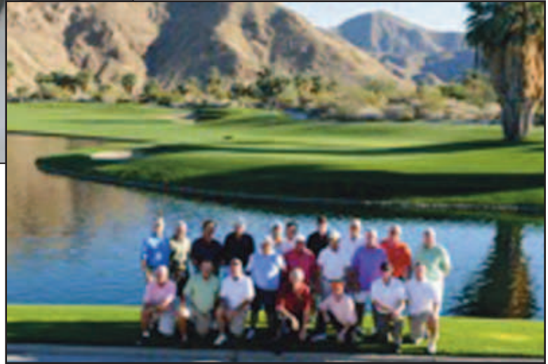
Right: While Aurora was digging out of snow, about 20 members of Heather Ridge Men's Golf Club enjoyed six days of golfing in Palm Springs, California.