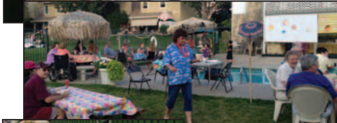
Photos from Heather Ridge South's Annual Luau Picnic