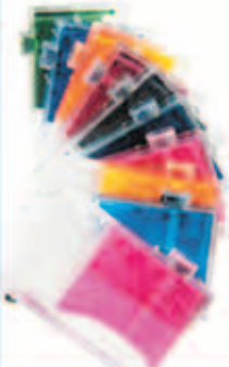
Photo paper for your printer Create art with your printer, some photo paper and your imagination. We stock photo paper and ink for all brands of printers, copiers and MFP's, even yours!

Convenient Locations THINK! Toner & Ink stores are located off of major highways. Our Aurora store is open 7 days a week and Denver is open 6 days a week for your convenience.